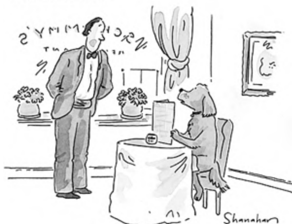
"Is the homework fresh?"