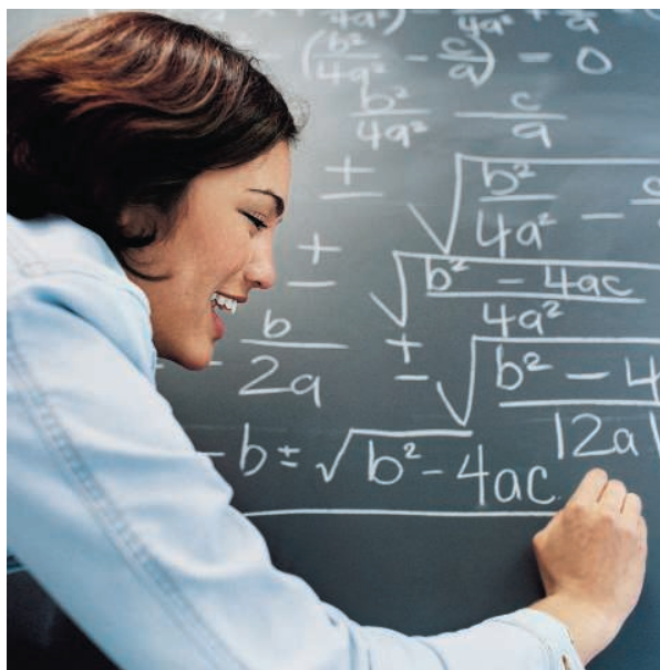
Math class. High-school math prepares students for college science.

Our research examines correlations and does not offer the proof of causation that an experimental study could. However, the lack of significance in cross-disciplinary coursework supports the claim that cross-disciplinary